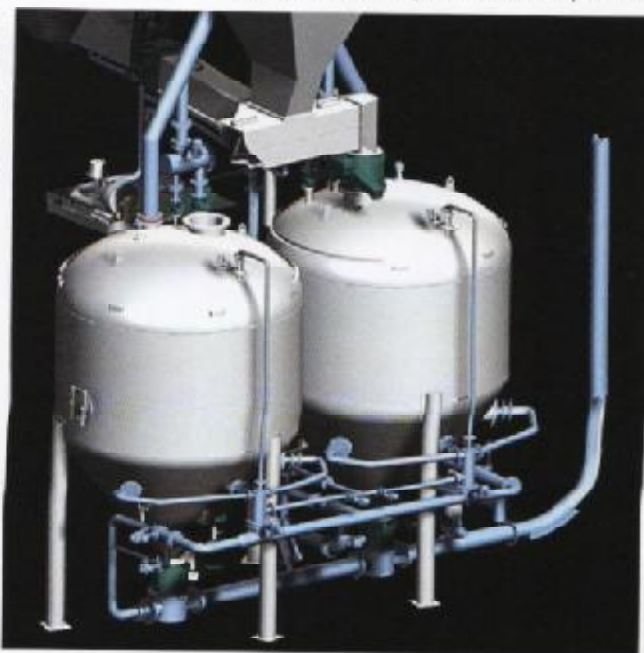
A typical Rula double pressure vessel system

"We offer the full scope from under one roof," he says. "Ours is truly a full turnkey solution, anchored in a core of excellence,