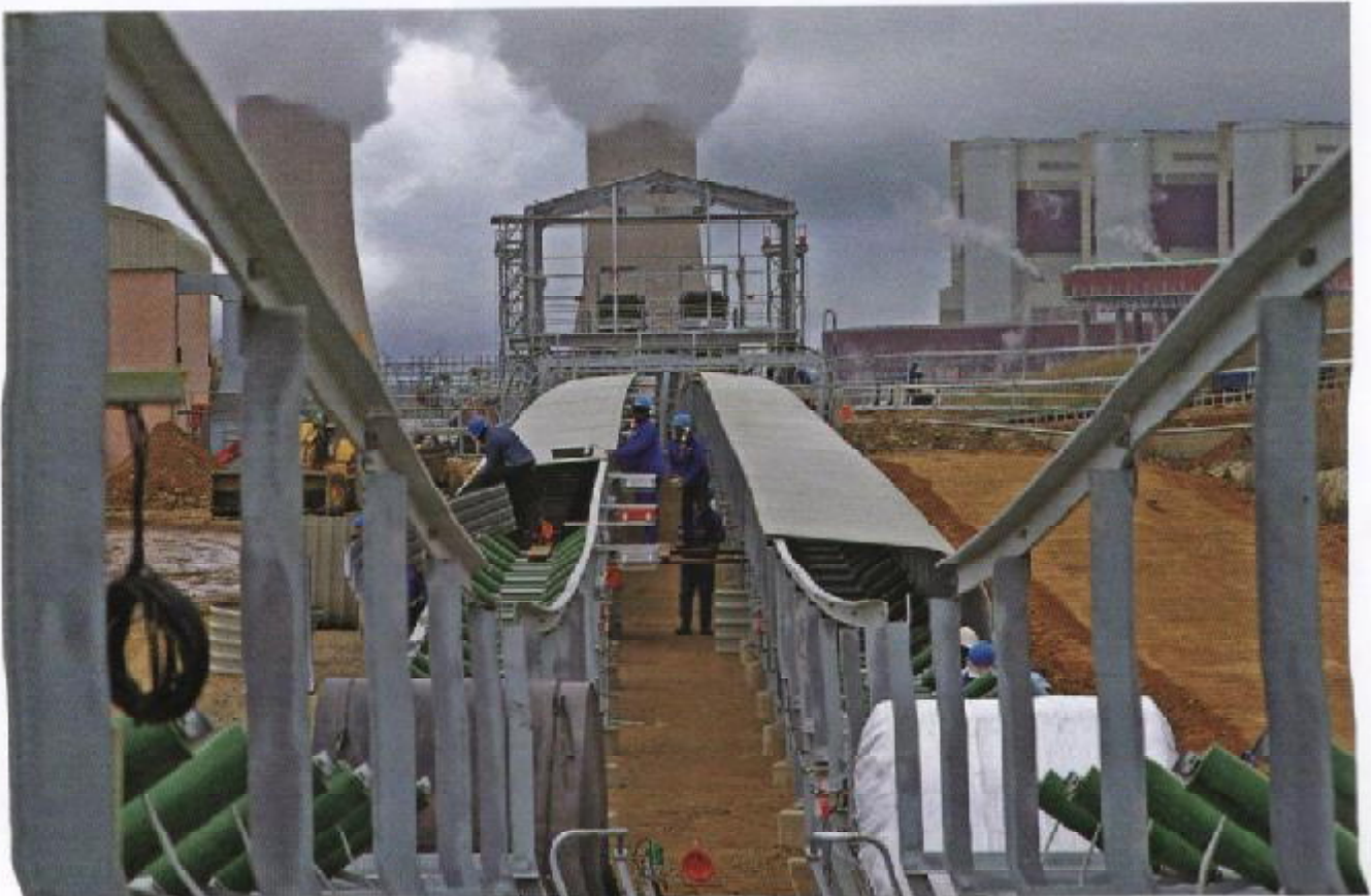
A conveyor system installed at a power station

The system is briefly explained: Figure 1 shows conveying in a fairly typical system. Some have described such a system as continuous, but it is not an accurate description. The curve shows the conveying line pressure (in kPa) vs. time. The conveying sequence of each pressure vessel is quite distinct as a pressure peak at approximately 400kPa. The troughs (at approximately 160kPa)